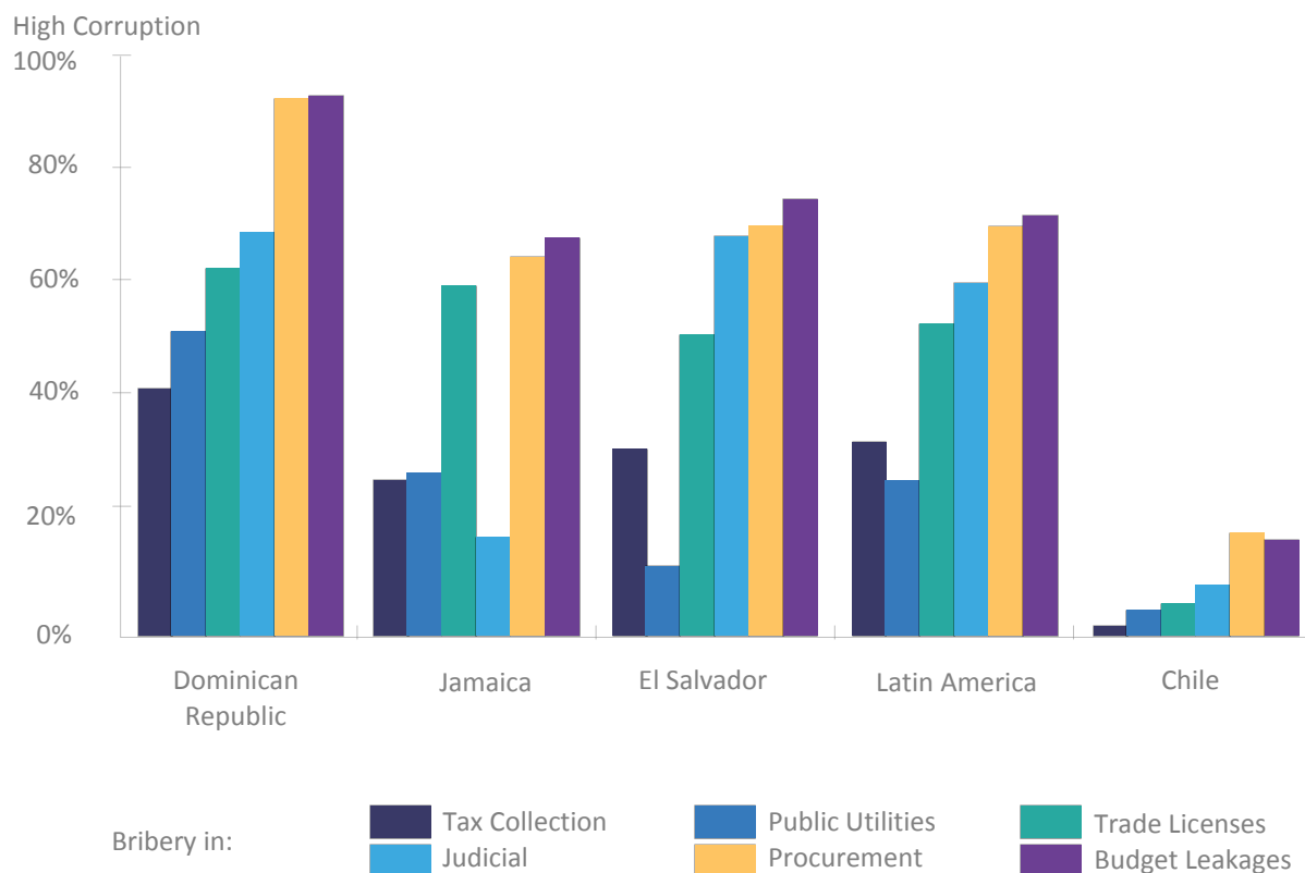
Figure 1: Frequency of different types of bribery and budgetary leakages, Dominican Republic in comparative perspective—data for 2011 (from WEF survey of enterprises)

Margins of error apply, inter alia due to relatively small sample.